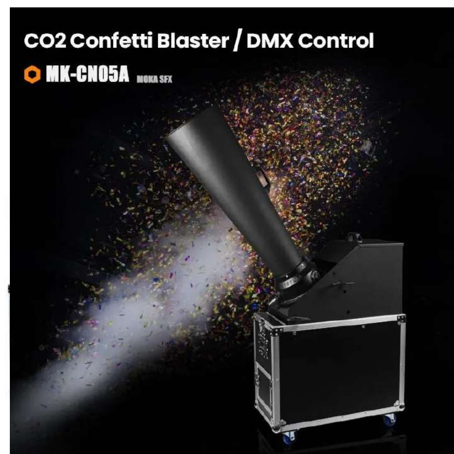
CO2 Confetti Blaster / DMX Control